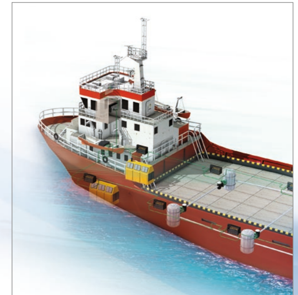
CX-Server OPC automatically switches communications without data loss, making it ideal for applications requiring redundancy, such as the marine industry.

CX-Server OPC has all the functionality needed to switch automatically within a system of redundant PLCs and networks, allowing software to see the configuration as a single PLC. This makes it ideal for applications where in-built redundancy protects against malfunction or damage. This redundancy is further enhanced by PLC function blocks that enable two PLCs to decide which is active and which is on standby – with no intervention from the user. A sample function-block included in CX-Server OPC can be added to a PLC program to deliver the redundancy feature. Each PLC has two network connections which are tried in turn before fail-over happens.